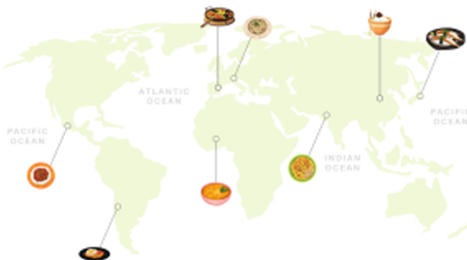
FIGURE 3 Popular rice-based dishes worldwide. Arroz con frioles in central America and Arroz con huevos in south America; paella in Spain (cv Bomba) and risotto in Italy (cv Arborio); Jollof rice in West Africa; Chicken biryani in India; rice bowl in China; rice for sushi in Japan. [Color figure can be viewed at wileyonlinelibrary.com ]

high-yield varieties and innovative agricultural practices (e.g., mechanization, irrigation, fertilization). What will happen in the next 50 years? Rice yields are being progressively affected by extreme weather events such as sudden changes in ambient temperatures, heat waves, drought and flooding. Facing environmental degradation and changing climate, mitigation and adaptation strategies should rely on cutting-edge technologies (e.g., precision farming) as well as genetic improvement aimed at obtaining climate-smart varieties.