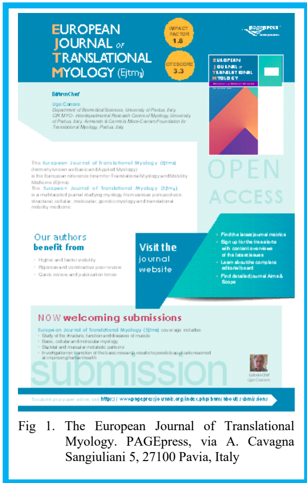
Fig 1. The European Journal of Translational Myology. PAGEpress, via A. Cavagna Sangiuliani 5, 27100 Pavia, Italy

Eur J Transl Myol 34 (4) 13432. doi: 10.4081/ejtm.2024.13432