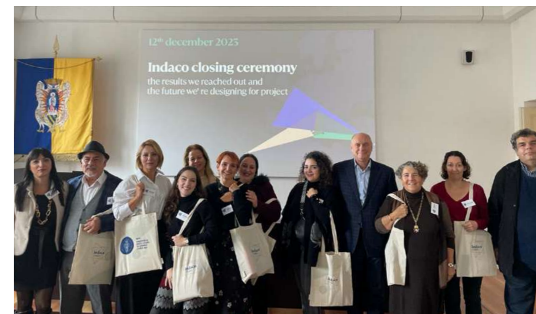
04. The final meeting of the project, with some of partners involved.