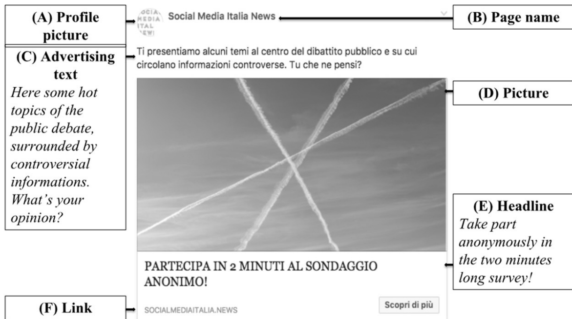
Figure 1. Template for the Facebook advertisement, as it appears in the desktop view on computers.