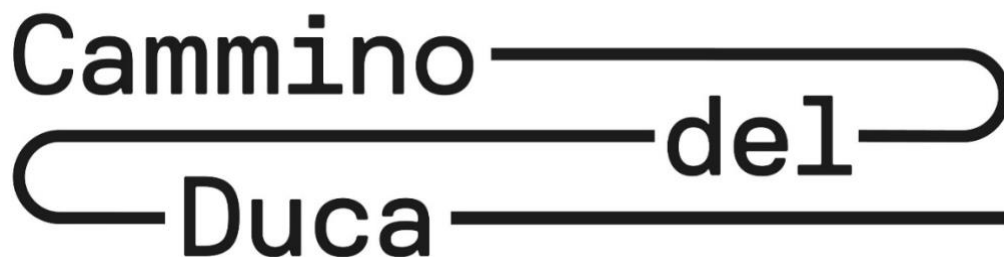
Figure 2| The Logo of the Cammino del Duca.

The graphic design of the Cammino del Duca consists of an acronym (CDD) whose layout is variable with respect to a basic grid and in which the letters are connected by straight lines and curves that recall cartographic notational systems [Figure 2].